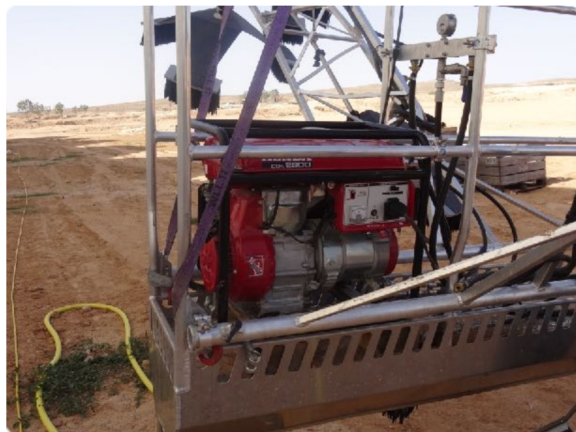
Powerful Honda generator