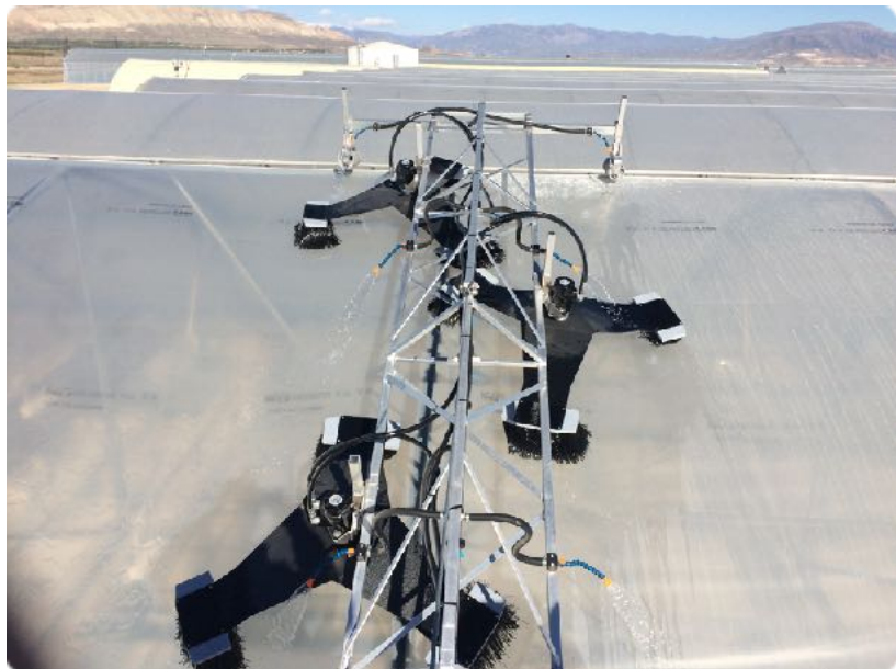
Adjustable hydraulic driven brushes