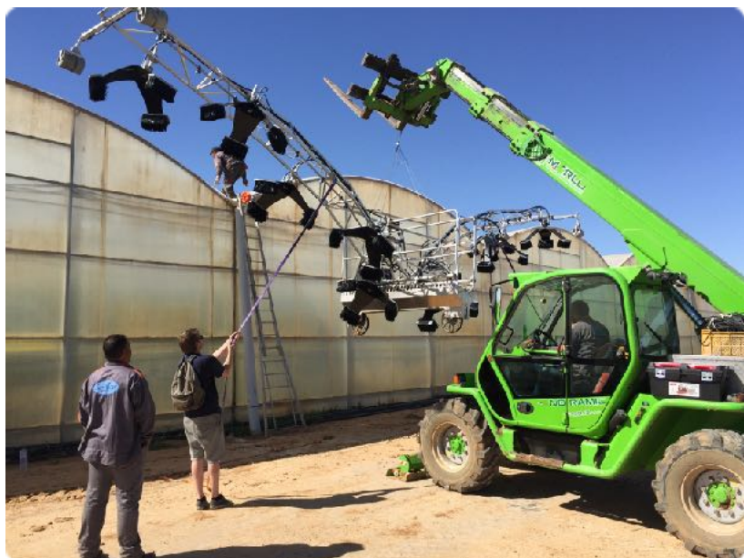
Easy to hoist on the roof